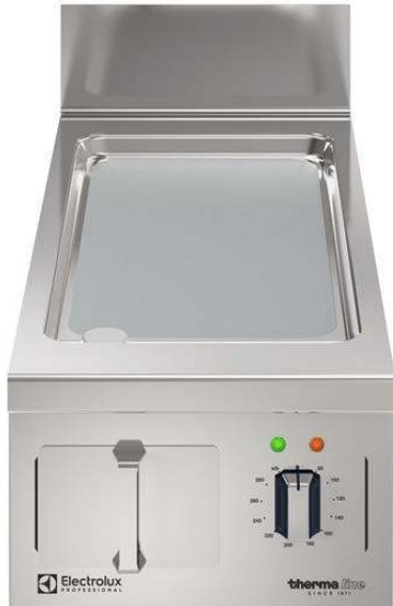
589915 (HCHMBBDODM) Electric Fry Top with smooth Scratch Resistant NitroChrome3 cooking plate, 1 zone, one-side operated with splashback - Marine USPHS (only M2M)